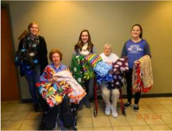
Donating blankets to the YWCA